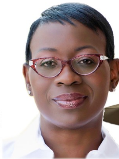
NINA President, Our Revolution (US) TURNER

Economic and racial justice. A living wage for all. Health care as a right. Big money out of politics.